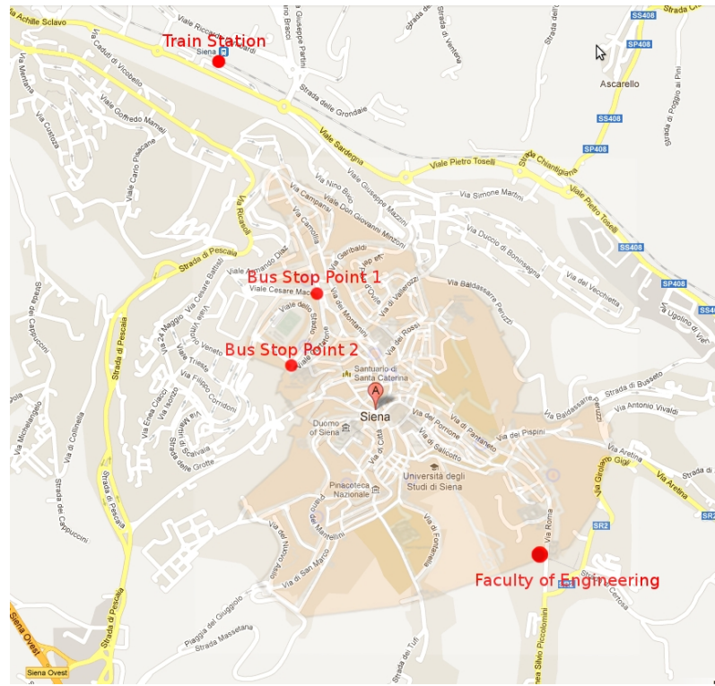
Figure 1: Siena Map with Train station, Bus stops and Faculty of Engineering