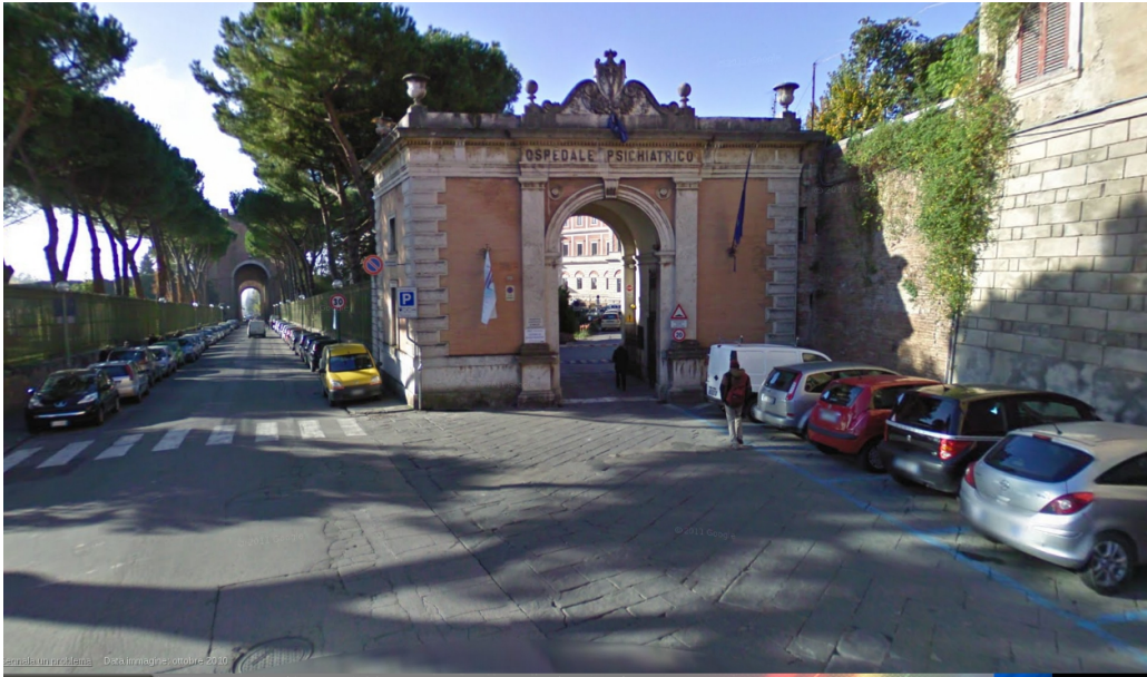
Figure 2: Picture of the entrance of the Faculty

In Fig. 2 is possible to see the main entrance of the Faculty structure. The principal location of the Faculty is represented by the huge building one can see once passed through the gate (already visible in the picture).