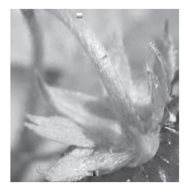
FIGURE 5: A particular of an attacked version of the image Strawberry uploaded by A. Westfeld and exhibiting a PSNR value of 41.21 dB; a modification of only a small number of blocks was enough to remove the watermark.