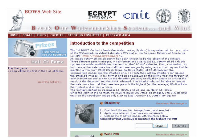
FIGURE 1: The home page of the BOWS website, available at http://lci.det.unifi.it/BOWS.

The choice of the watermarking algorithm was dictated by the following factors: (i) desire to test a modern system based on the theory of side informed watermarking; (ii) necessity of obtaining the consensus of the inventors of the watermarking systems to use it in the contest; (iii) necessity of using a complete system, including the exploitation of the human visual system for better watermark hiding. With the above