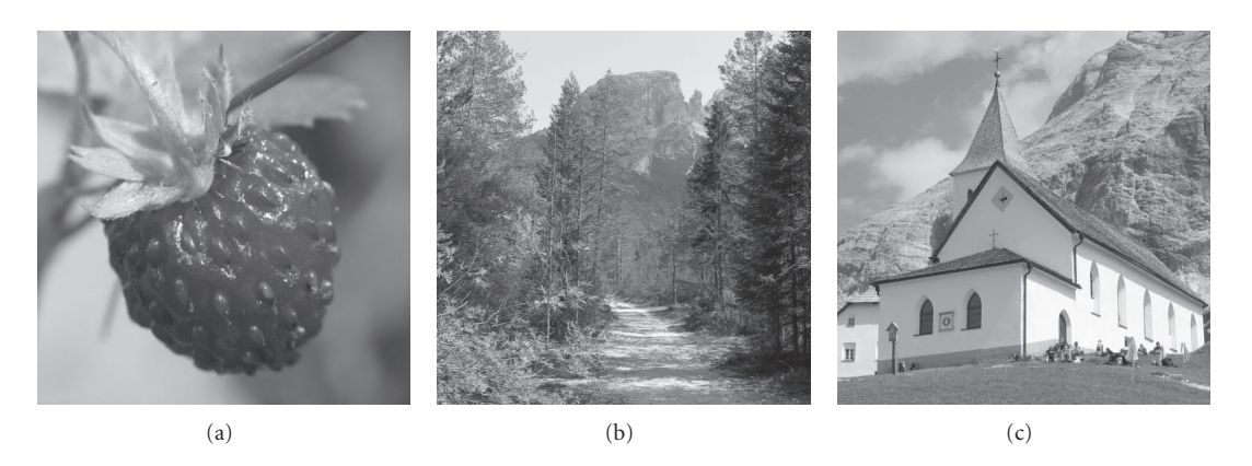
FIGURE 4: The three original images, Strawberry, Wood Path, and Church, used for the contest.